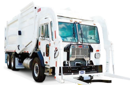
Available with Curotto-Can commercial grabbers