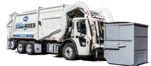
Optimized Weight LowRider body package