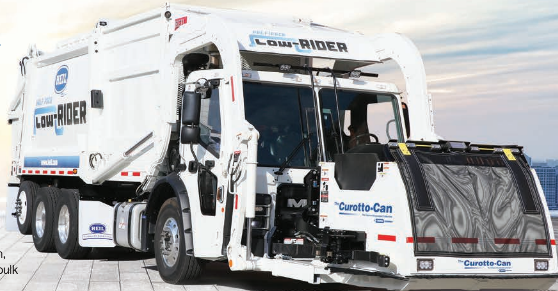
Shown with optional Half/Pack LowRider® Body and Curotto-Can® Residential Package

* Heil does not provide tax advice. Please consult your tax advisor regarding the specific tax implications of your selected product.