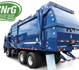
Available with optional CNrG® Tailgate