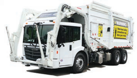
Available with articulating arms for EconicSD chassis